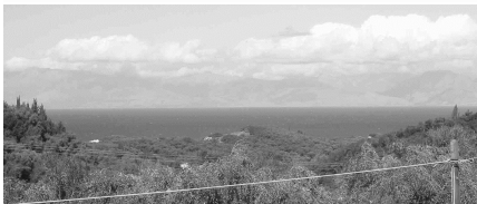
SEA VIEW LAND at Karrousades. Building plots in Town Planning, only 25,000 euro!!!