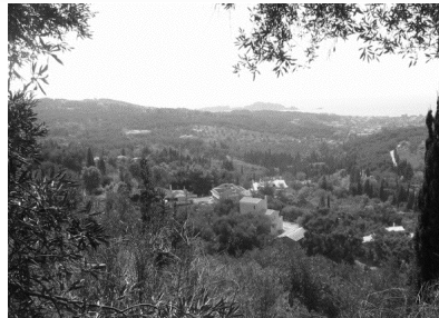
KATIKIA HOUSES - New location at Kavadades, near Arillas, with great sea view! Four detached houses with small garden. 140,000 euro each Also two plots of 400 sq.m. in Town Planning with sea view. ONLY 30,000 euro each!!!