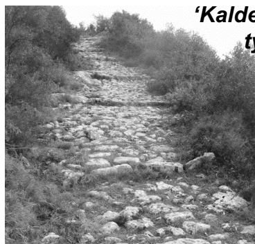
'Kalderimi': typical stone path

Guiding fee 2 euros, kids under 12 and dogs free