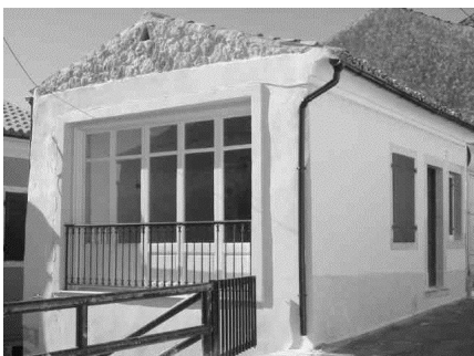
LYRA HOUSE , Ano Korakiana. Imaginatively restored two bedroom house with guest studio and roof terrace with sea view. 150,000 euro