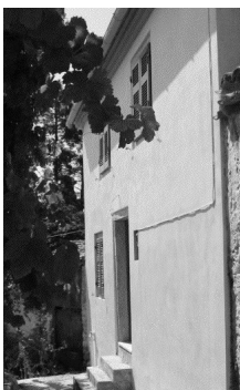
THEOTOKI COTTAGE Very pretty just-renovated one-bed- room cottage in a beautiful village near beach. Tavernas one minute walk. Sun terrace with view. Paperwork clear. 125,000 euro